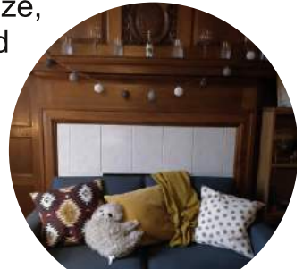
A* Grade Main site Room

how far you are from a kitchen. First-year rooms vary in size but are typically close to kitchens and social spaces, and the majority of people will share a bathroom with no more than one other Fresher.