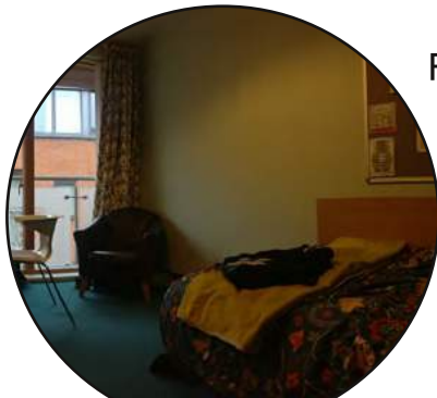
A/B Grade Offsite Room

For accommodation in second year, you're given the opportunity to choose your flatmates for Oriel's 'sets' and flats available in the student ballot.