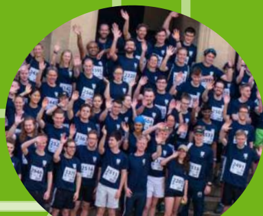
Town and Gown 10K