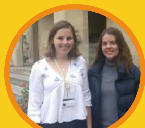
Lara + Lara