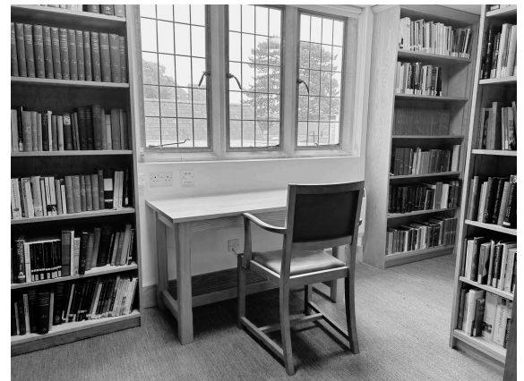
Individual Study - 1st Floor

There are a number of individual study spaces on the First Floor Library. One area is located by the windows overlooking Third Quad, and another two located up the small staircase by the group study table in the second study room. These two are especially quiet areas, one within a wooden study cubical, and the other in front of a large window (with a roller blind for sunnier days).