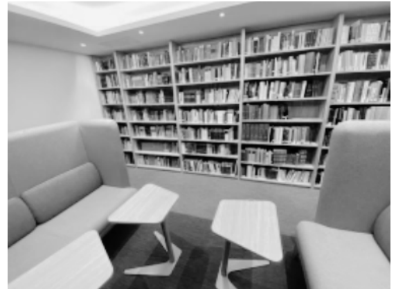
First Floor Group Study

The First Floor Library features a variety of seating and desk options for group study, from high backed sofa seating, to table based group seating. One area is flooded with natural light, with views over Third Quad, whilst the other is lit artificially, with a calm, cosy atmosphere, making it ideal for quiet discussions and studying together. This area houses the English Language & Literature and Modern Languages Collections. There is a self-issue machine available for issuing, returning, and renewing your books.