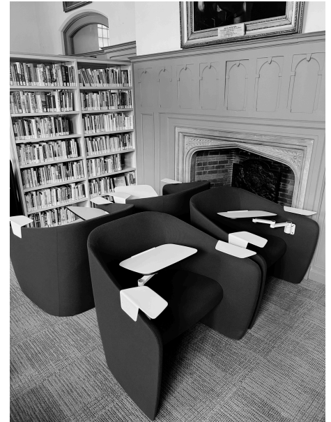
Ground Floor Library

The wooden staircase between the Library Office and the sandstone arch takes you up to the First Floor.